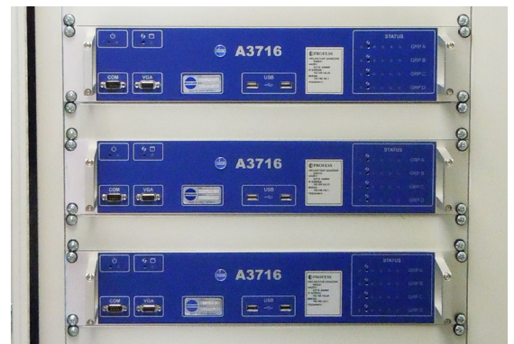
Example of use - 3 pieces of A3716 2U

The A3716 module contains 16 AC, 16 DC and 4 TACHO inputs. All channels are measured simultaneously. The A3716 modules can be easily combined to create a system with more channels.