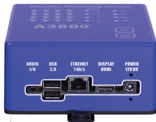
› A3800 - BOTTOM PANEL